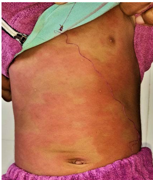
Fig. 1 Multiple annular polycyclic erythematous urticarial plaques on trunk.

Erythrocyte sedimentation rate (21 mm first hour reading) and C-reactive protein (19 mg/dL) were raised.