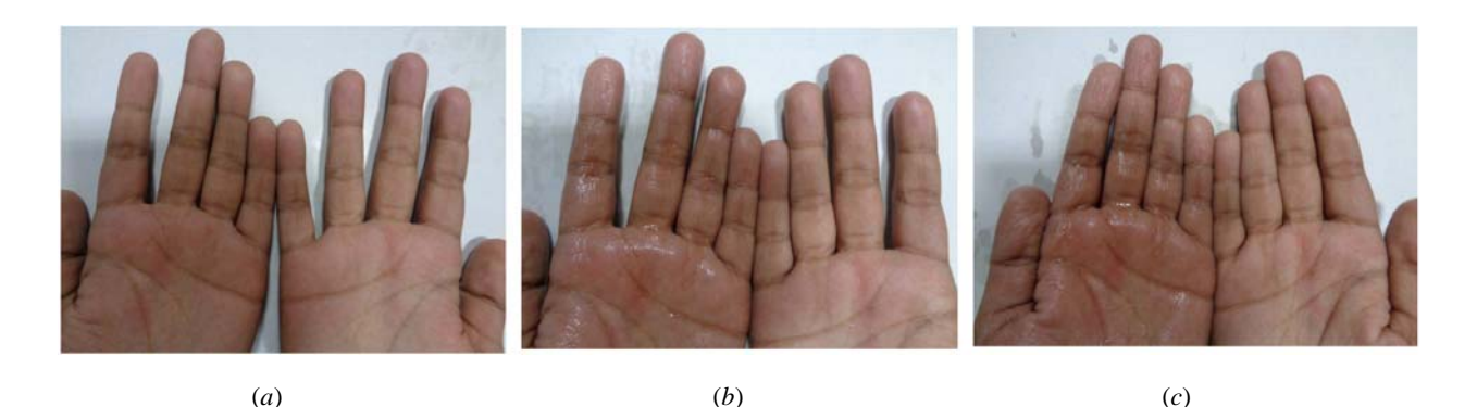
FIG. 1 showing hands at (a) start and (b) at 1 minute of immersion of left hand in RO water in standard tray. Figure I(c) shows (aquagenic wrinkling of left palm and taken as end point by observer) at end of 2 minutes of immersion in the same child.

Statistical analysis: Data were managed using Microsoft Excel and analyzed using Stata 11.0 software. The prevalence of aquagenic wrinkling in CF was the proportion of children positive for aquagenic wrinkling in 5 minutes. The prevalence was compared with that in carriers and controls. Sensitivity and specificity of aquagenic wrinkling at different time intervals was calculated using sweat test as diagnostic gold standard for CF. Mean and median time for development of wrinkling was calculated. Mean time for wrinkling in CF children with positive DF508 and negative for DF508 were compared. For determination of optimal cut off time, Receiver operator characteristic curve (ROC) was drawn.