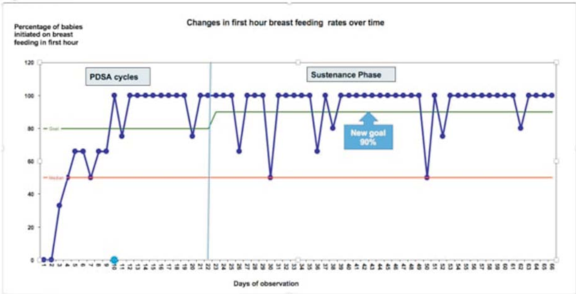
WEB FIG. 3 (a) Run-chart showing compliance to first hour breast feed initiation gradually increased from a baseline of zero to well above our goal by PDSA-5. From near the end of PDSA-4, 16 data points are above the median indicating a significant shift; (b) Extended run chart during sustenance phase showing that first hour breastfeeding initiation rates have continued to be near 95-100% on most of the days. We revised our goal to 90% in this phase.