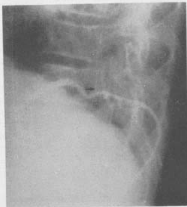
Fig. 3. Post embolisation arteriogram shows complete disappearance of tumor blush. Note well-visualized anterior spinal artery (arrow).

abnormal epidural vessels was also excised. Her postoperative course was uneventful.